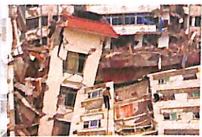
Chien-min Chung/Getty Images