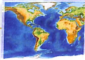
NOAA National Geophysical Data Center (NGDC)